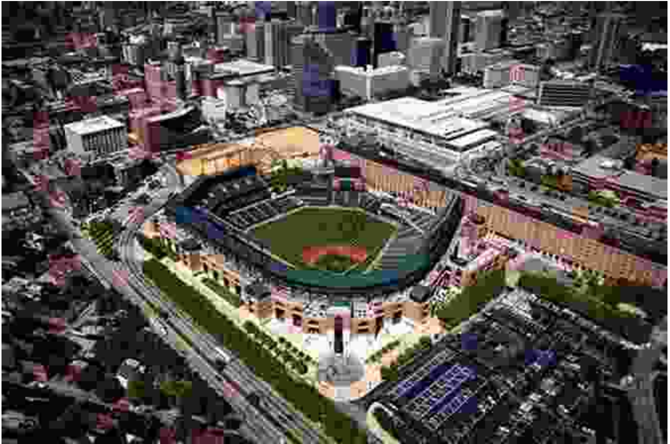
Oriole Park at Camden Yards, home of the Baltimore Orioles