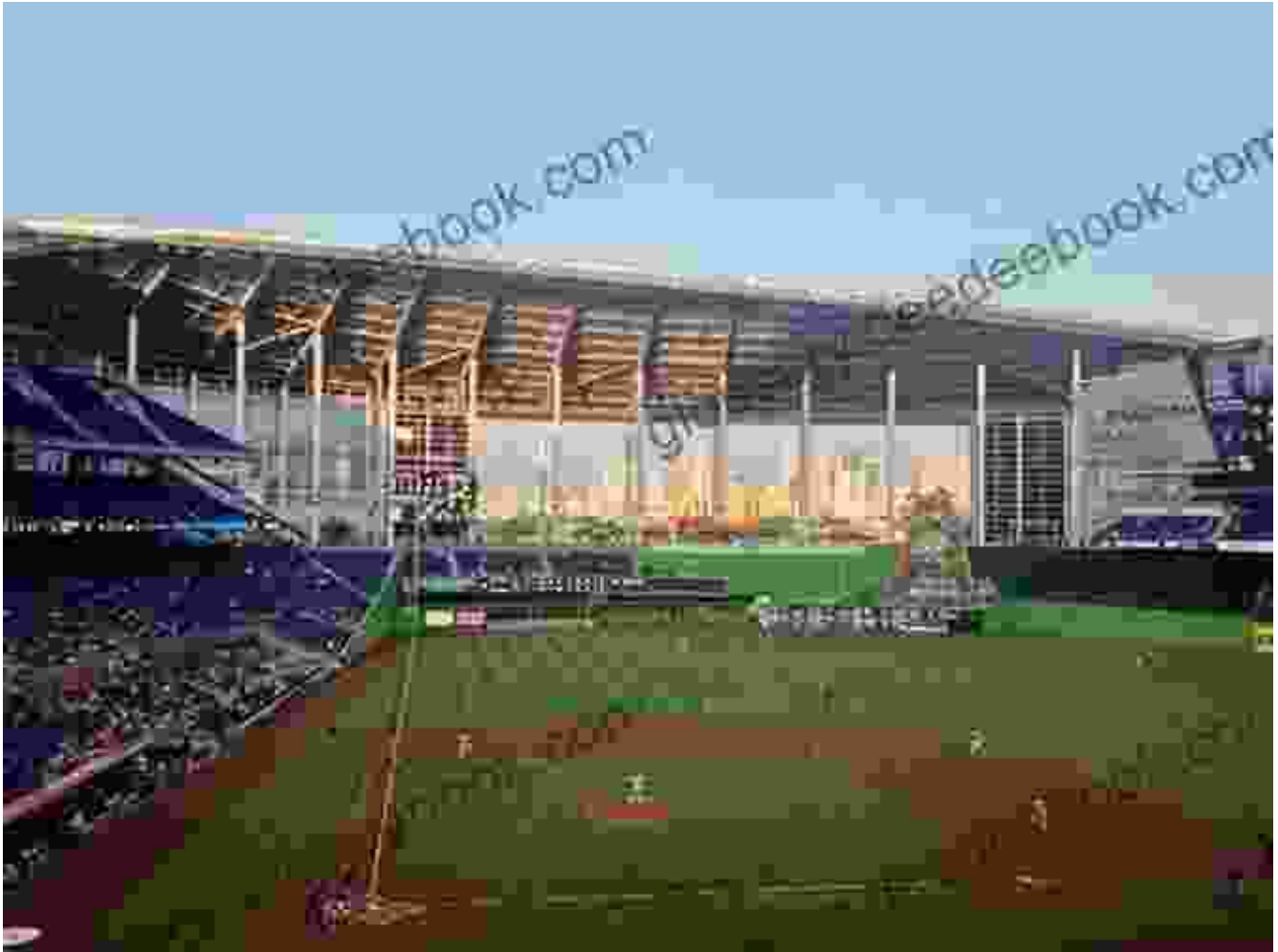
LoanDepot Park, home of the Miami Marlins