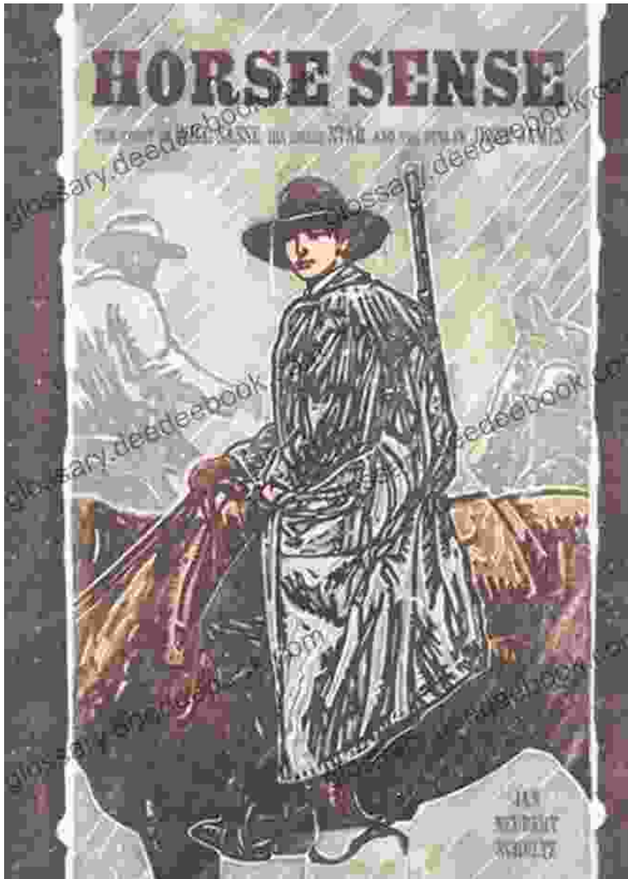
Horse Sense: The Story of Will Sasse, His Horse Star, and the Outlaw Jesse James (Adventures in Time)