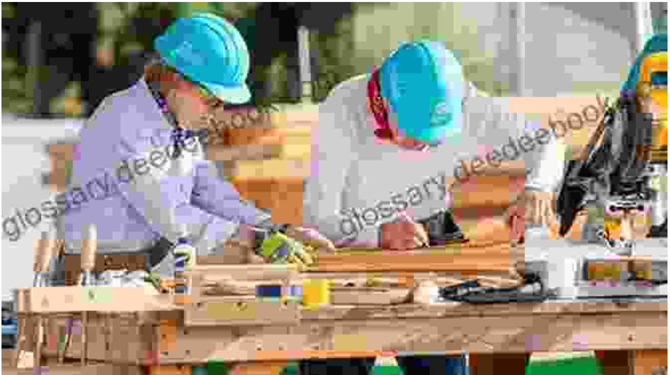
The Carter Project team in action

As The Carter Project concludes its mission, its legacy will continue to inspire generations to come. The discoveries made in the excavation sites have enriched our understanding of ancient Egypt and its profound influence on the modern world. More importantly, the project's emphasis on redemption and personal transformation has left an enduring mark on the hearts of all who were touched by its journey.