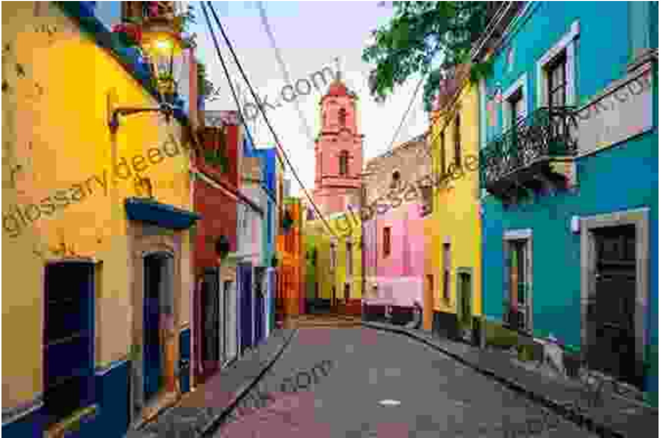
The office of an alcalde in a Mexican town

One of Bell's most notable failures was his attempt to establish a town council based on English models. The council, composed of prominent Mexican citizens, refused to cooperate, seeing it as an infringement on their traditional authority.