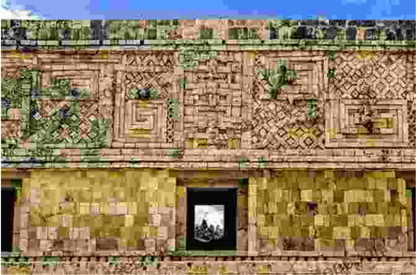
Nunnery Quadrangle, Uxmal

Uxmal's architectural elegance and artistic finesse are a sight to behold. Wander through the Nunnery Quadrangle, its intricate carvings and elaborate facades showcasing the Mayans' mastery of stonework and their deep spiritual beliefs.