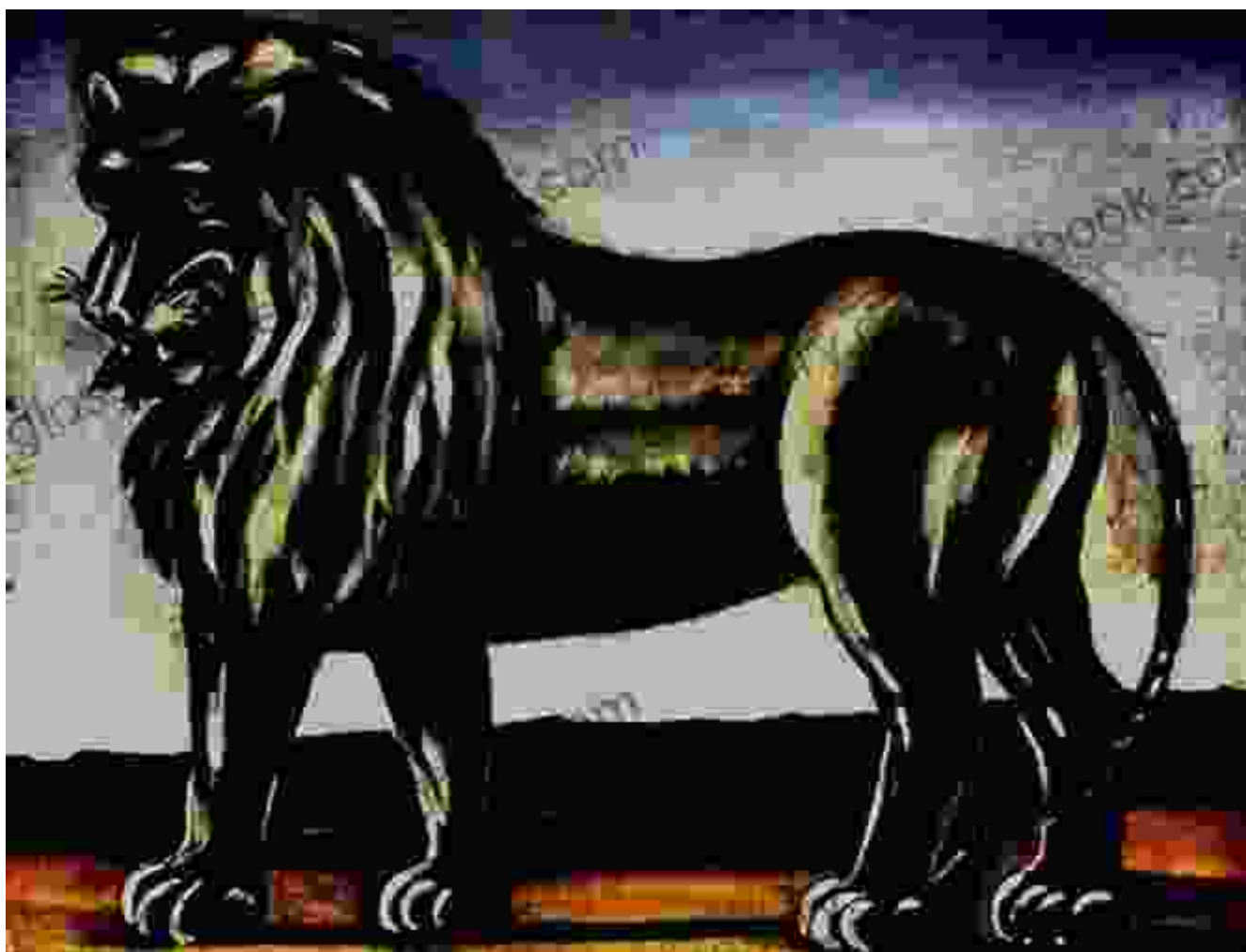
Niko Pirosmani, "Lion Hunter" (1905)

fascination with animals and features a dynamic scene of a hunter battling a lion.