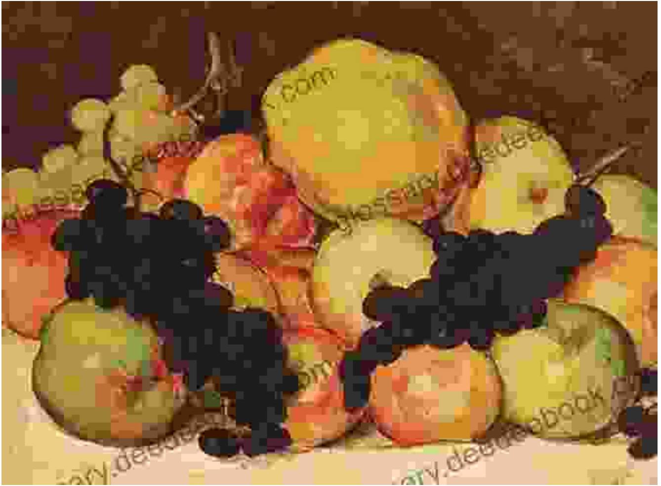
Still Life with Fruit, 1925