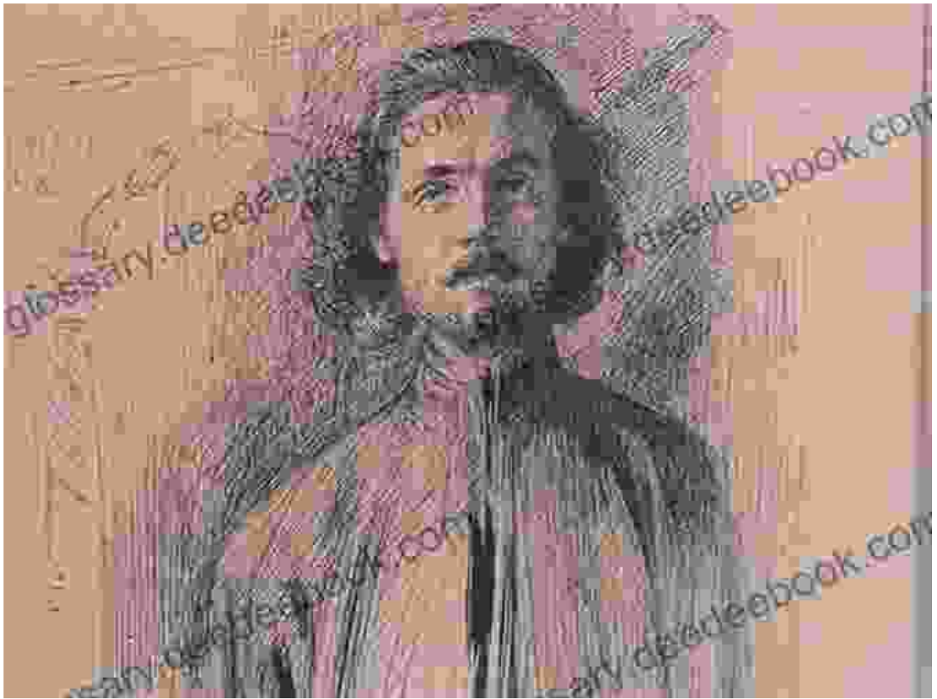
Portrait of a Man, 1915